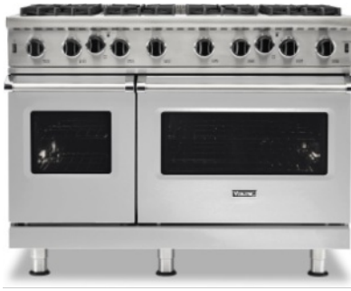
48X24 GAS OPEN BRNR RNGE-8 BR VVGIC54828BSS