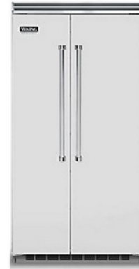
Viking Side-by-Side Refrigerator VVCSB5423SS Stainless Steel