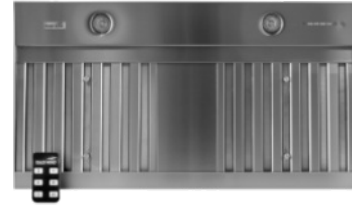
48 1200 CFM SS TVSL44812RC