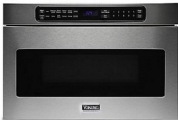
Viking Microwave Drawer VVMOD5240SS Stainless Steel